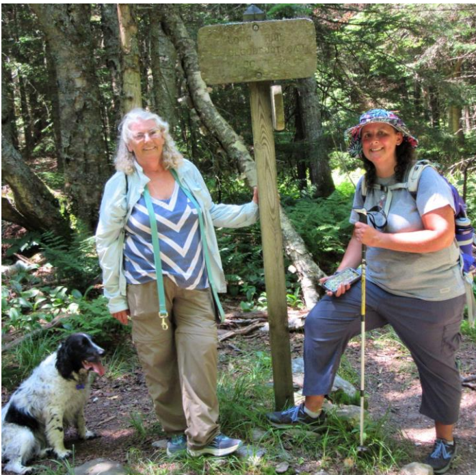
Chittenden Brook Trail, Rochester, July 16

Turnout has been strong for work parties this spring and summer and much was accomplished: waterbars were cleared, blowdowns dispatched and shelters spruced up throughout our section of the Long Trail, which runs from Route 140 to Route 4. The Sargent Brook crossing in Shrewsbury has been studied east to west to north to south and upside down, but no solution has yet been found that satisfies all parties involved, so watch S&B for the next chapter in this continuing saga. On the Sherburne Pass Trail, the sink hole is once again attempting to devour the trail, so our crews have flagged a reroute, pending a look at the easement wording by the main club. Larry has also whacked the weeds at the Route 4 crossing, making the parking lot more visible and hopefully safer from vandals. Larry and Dave have been training a crew from the Allen Street School, a much-needed infusion of young energy behind the saws!