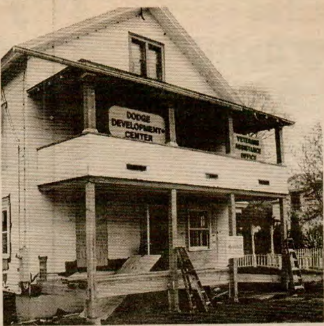
Renovations continue at the VVA's Dodge Development Center in Rutland

In an attempt to make the occasion a family affair, there will be plenty of fun activities outside for the kids, including clowns, jugglers, magicians, face painting, games, ice cream, cotton candy, and popcorn. The cost is $5.00 per person at the door; children under 12 are free. The day should be fun for the whole family and the Vietnam Veterans of VVA 1 look forward to a great day with a huge turn out. Let's help