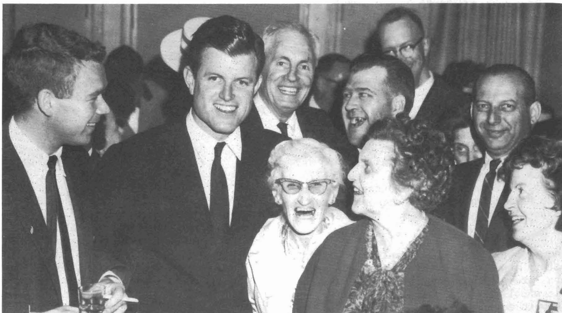
We know who HE is, who, when, where are the others?