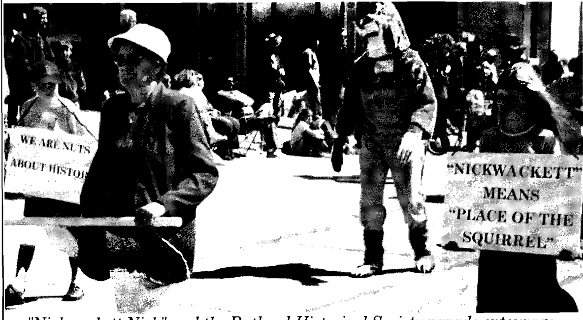
"Nickwackett Nick" and the Rutland Historical Society parade entourage.

also a gatherer but of historical attention of young and old. nuggets which it also stores. Here the parallel stops, for the Society can only the notice that mascot "Nickwackett justify its gathering if it has a plan to Nick" has gained for the Society. share these "historical goodies".