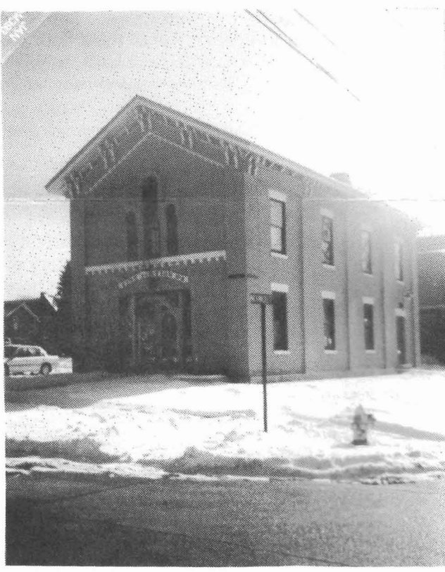
Main floor - no exhibit yet