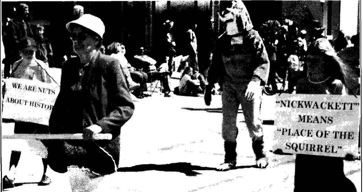
"Nickwackett Nick" and the Rutland Historical Society parade entourage.

For some time there has been discussion at the Society about the term "Nickwackett" and its meaning. It is an Indian term meaning "place of the squirrel". Squirrels gather nuts for food which is stored. The Society is also a gatherer but of historical nuggets which it also stores. Here the parallel stops, for the Society can only justify its gathering if it has a plan to share these "historical goodies".